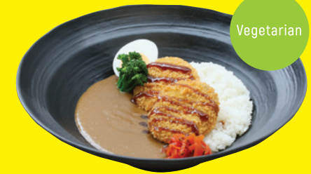
Pumpkin Croquette Kurry (v) 7.50