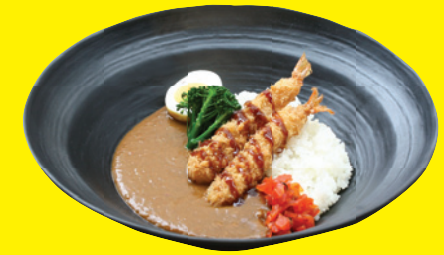
Prawn Katsu Kurry 9.50