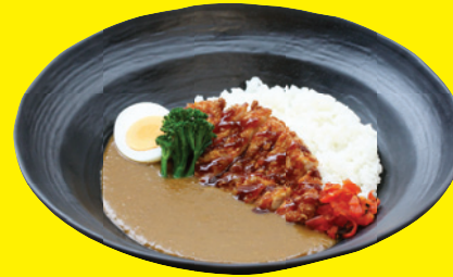
Pork Katsu Kurry 8.90