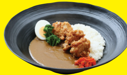
Chicken Karaage Kurry 7.90